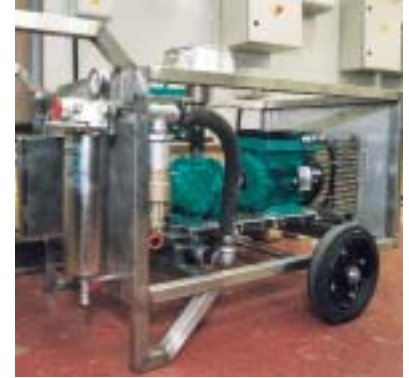
VSM attached to a mobile pump unit